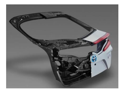
Figure 1: Rear door frame made of SMC [Toyota]

The aim of this Thesis is to perform process simulations for BMC parts made with recycled carbon fibers and resin, integrating unidirectional reinforcement fibers as flow obstacles in the final demonstrator of the current research project Deepflow. These results shall be compared to the real parts produced within the project.