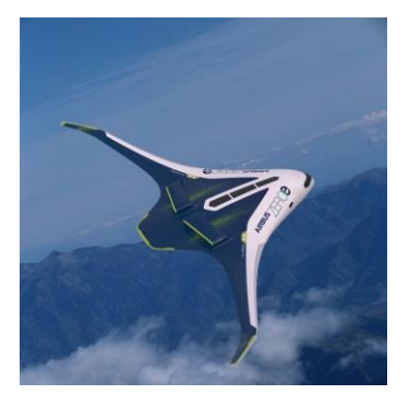
Figure 1: Zero-emission concept aircraft [Airbus]

Within the scope of this thesis, the mechanical behavior of a carbon fiber composite material under low temperatures and dynamic loading will be investigated. This will involve the development and comparison of manufacturing methods to produce suitable specimens of high quality. Since the characterization under the conditions above is not standardized, an important task is the verification of existing approaches and further improvement. Since the temperature and time dependence of a polymer's mechanical behavior interact, the superordinate goal is to identify and describe their relationship based on the experimental results.