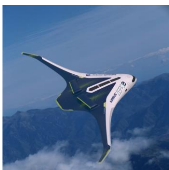
Figure 1: Zero-emission concept aircraft [Airbus]

This thesis will allow you to gain experience with simulation software and programming and in the processing and characterization of materials, representing a definite advantage in your personal development for future engineering activities .