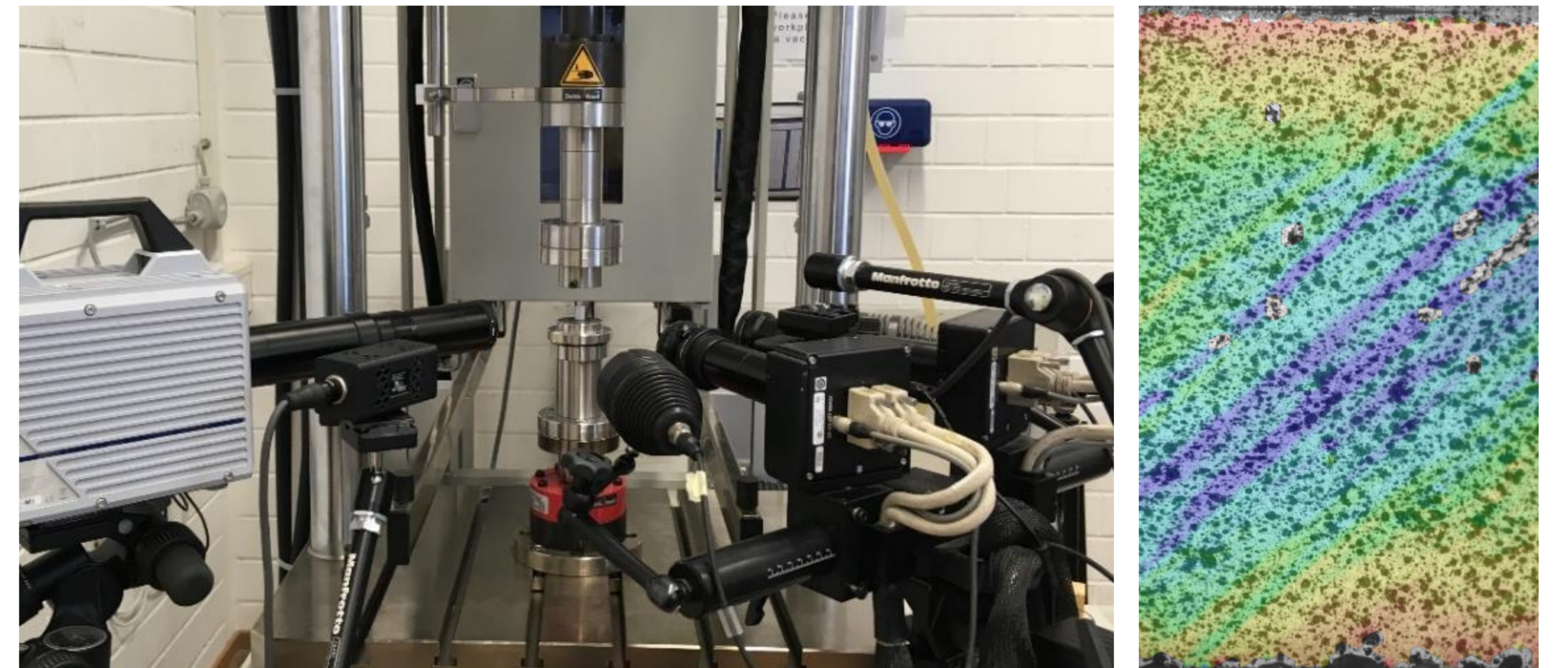
Fig. 2: Left, example of the complex experimental setups used in the dynamic characterization of composite materials. Right, strain field measured using digital image correlation

Composites develop their properties during the manufacturing process. At the same time, the manufacturing process needs to be designed around the behavior of the raw materials. Process parameters like temperature and pressure, and the appropriate equipment are selected based on their thermal and mechanical behavior. The optimization of manufacturing processes to efficiently achieve the desired composite properties is a key activity at our chair.